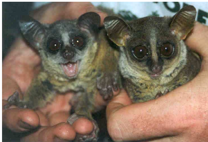
Figure 2 G. udzungwensis (left) and G. orinus in the hand.

The other lowland sites revealed more populations of Otolemur garnetti and Galagoides udzungwensis around the Uluguru Mountains particularly with the relation to habitat type and habitat alteration due to logging or planting of exotic tree species. The advertising calls of O. garnetti , the ‘trailing call’ and G. udzungwensis ‘the single unit rolling call’ as described in Honess (1996), were heard consistently at these sites.