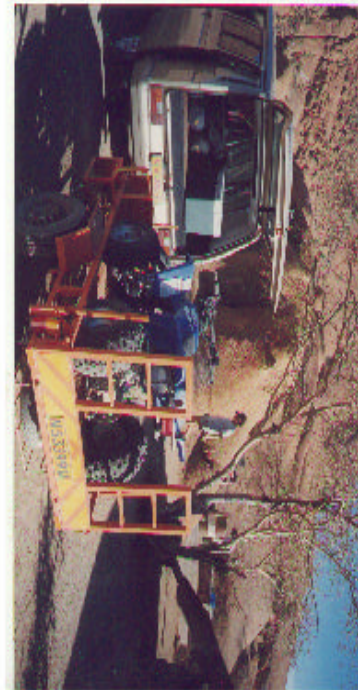
Spitzkoppe Community Based Restcamp